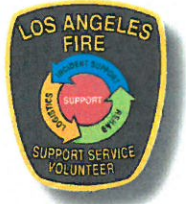
Support Service Volunteer Unit