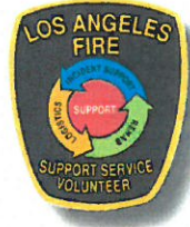
Support Service Volunteer Unit